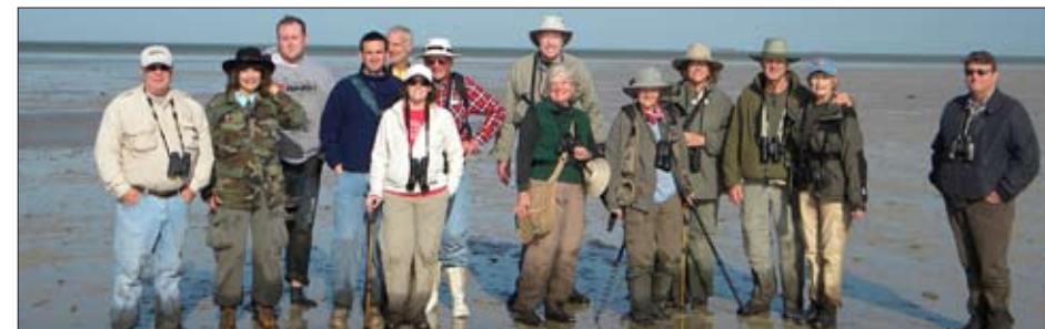
SUN AND FUN ON THE SALT MARSH SAFARI. Participants in this year’s trip were greeted with sunny skies, comfortable temperatures, and great sights of the inhabitants of the marsh.