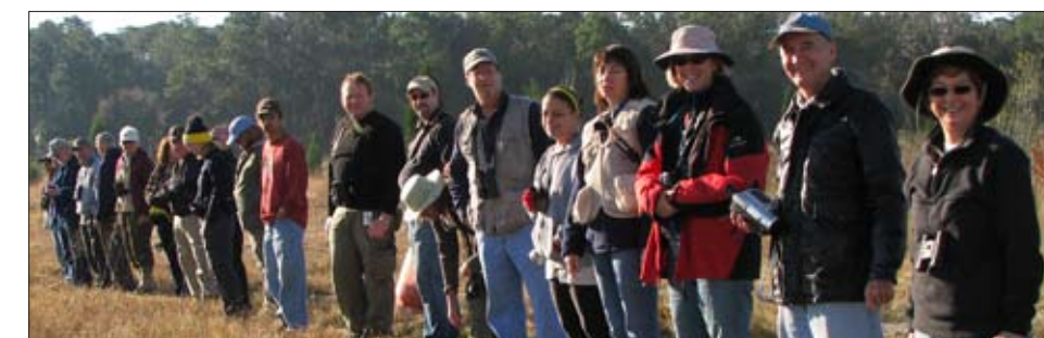
SPARROW DRIVE PARTICIPANTS in Weekiwachee Preserve are lined up and ready to start.