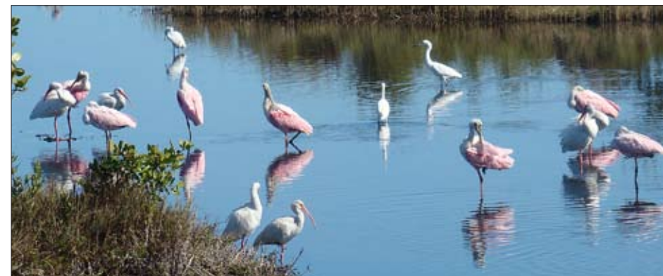
MIXED FLOCK. Roseate Spoonbills, White Ibis and Great Egrets share one of the ponds at Merritt Island National Wildlife Refuge. Participants in the Jan. 14 trip noted that a drought is adversely affecting wildlife in the area.