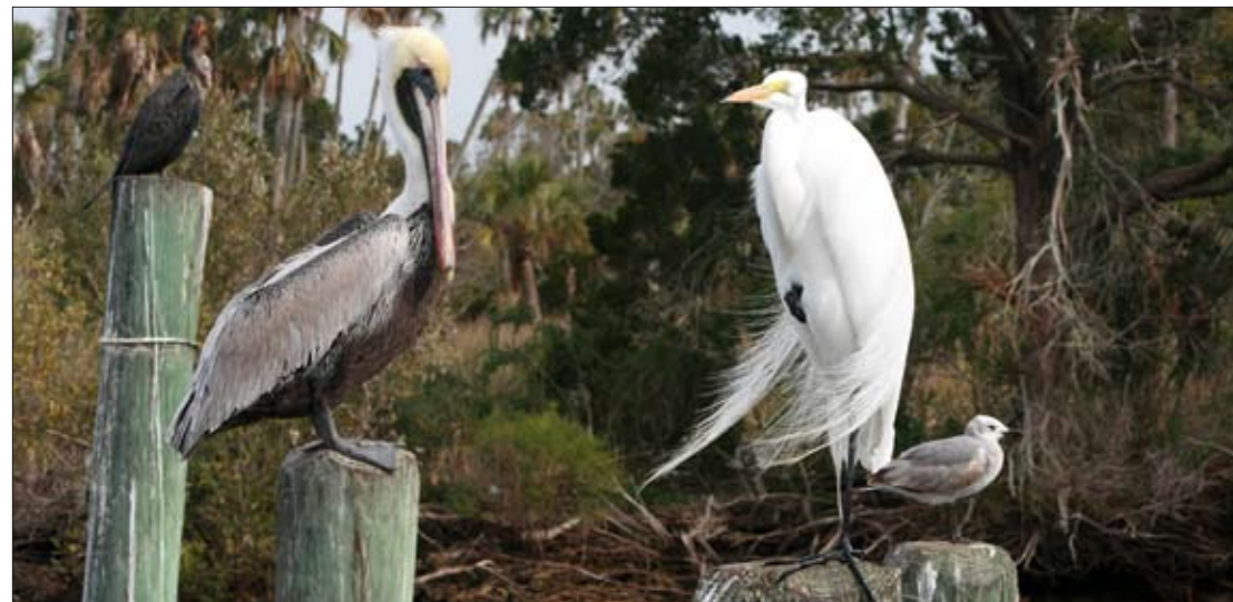
HANGING OUT TOGETHER ON A COLD, WINDY DAY

Meet at 8:00 a.m. at the gate on Ridge Manor Boulevard at Olantha Road. Following a short talk about the Preserve and the needed work, volunteers will cut small trees along firebreaks and in habitat restoration areas. Work will be completed