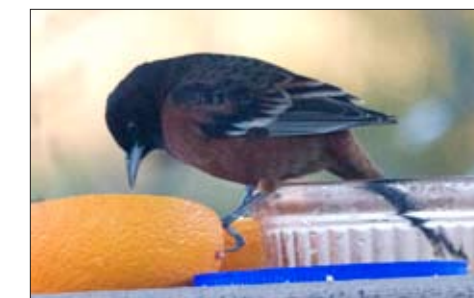
RARE VISITOR. This Orchard Oriole, enjoying a Florida orange, is the first of its species to be recorded on the Aripeka-Bayport Christmas Bird Count.