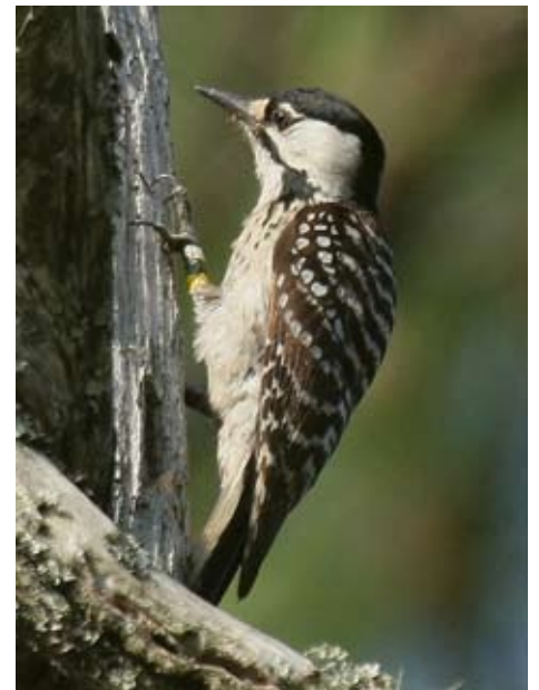
JUVENILE RCW. The hunchback posture of this bird helps to identify it as a juvenile. Adults tend to have straighter backs.