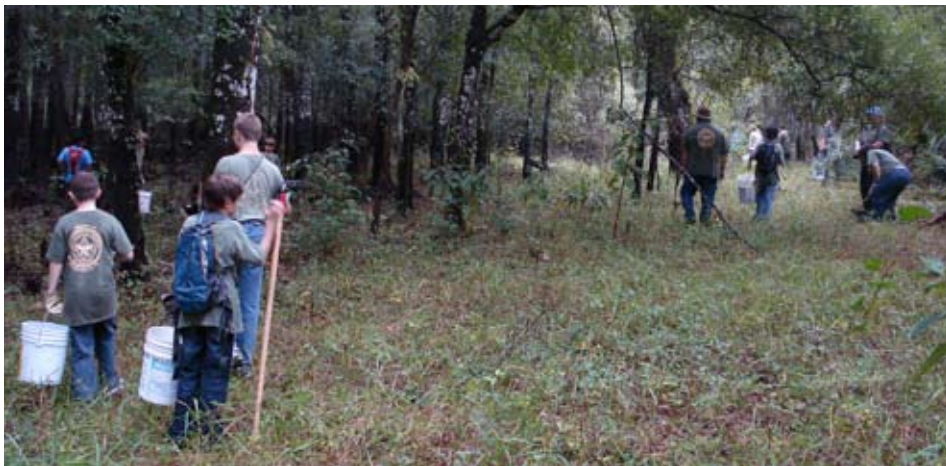
WORKDAY AT CYPRESS LAKES. On Sept. 25, National Public Lands Day, volunteers collected and removed trash from the preserve. Members of Brooksville Cub Scout Troop No. 71 were there in force.

The 331-acre Cypress Lakes Preserve is located in the eastern part of Hernando County, at the intersection of State Road 50 and Ridge Manor Boulevard.