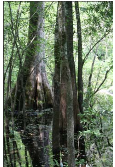
CYPRESS LAKES gets its name from a series of swamps where cypress trees predominate.

A section of the Florida National Scenic Trail winds through the preserve and provides opportunities for hiking, observing the variety of vegetative communities, and nature watching. Bird watching is most productive in the fall and winter months when migrants are present. Hernando County plans to